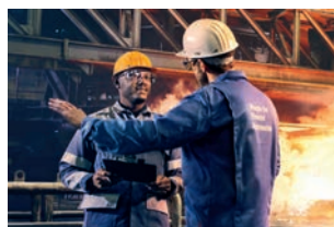
Mining, Minerals & Metals