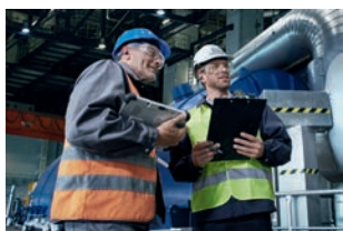
Power & Energy