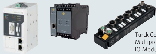
Turck Compact Multiprotocol IO Module

The Endress+Hauser WirelessHART and Bluetooth® portfolio is perfectly fit for plant asset management and remote monitoring. By creating a wireless channel for HART instruments you are getting access to extended measurement and diagnostic data of your physical assets. Besides saving material and labor costs, this also makes the digital transformation process for your plant faster!