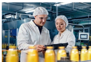
Food & Beverage

Browse this brochure, discover your options and get in touch with us. Our People for Process Automation will be delighted to support you in sustainably improving your processes and thus your products.