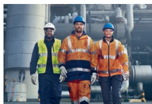
Oil & Gas / Marine