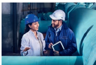
Water & Wastewater